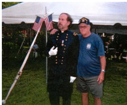
Boy! Was he impressed with me as we stood there "Buddy-Buddy" My Hero! Gen. Meade!

With all we do as an organization recruiting new members or contacting past members should be a "Breeze" There is a lot of pride in those members who participate in our meetings, Outreaches, Cruises, etc. Only so few of us take advantage of our great, meaningful Association.