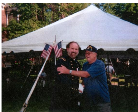
Who would have thought that a General can share a laugh with an enlisted guy!